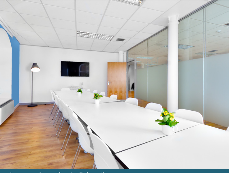
Communal meeting/collaboration space